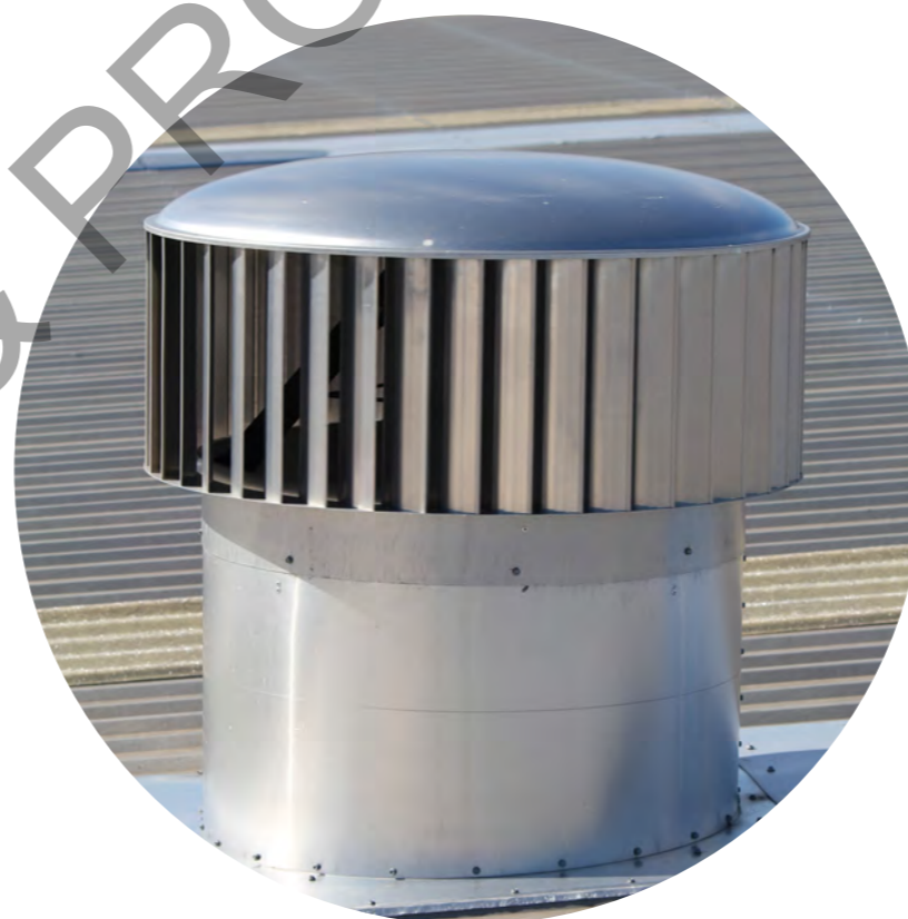
EcoPower installed at Edmonds Seven Hills, NSW, Australia.