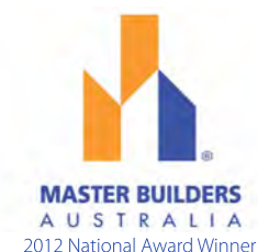
National Export Award for Edmonds Business

With strong synergies between insulation and ventilation in the building industry, Edmonds was acquired by CSR Building Products Limited in 2005. Its mission remains to create Technologies for a Sustainable Future.